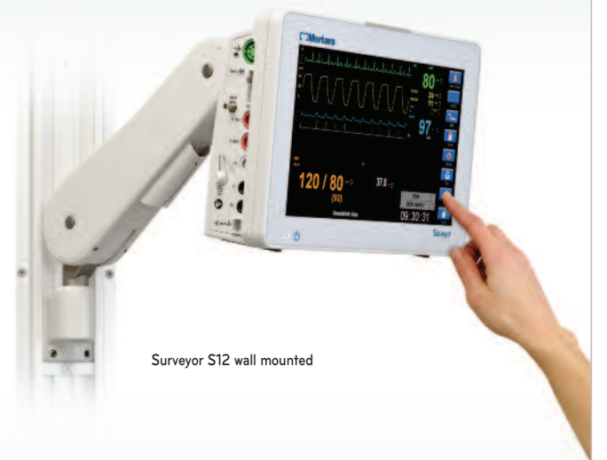
Surveyor S12 wall mounted